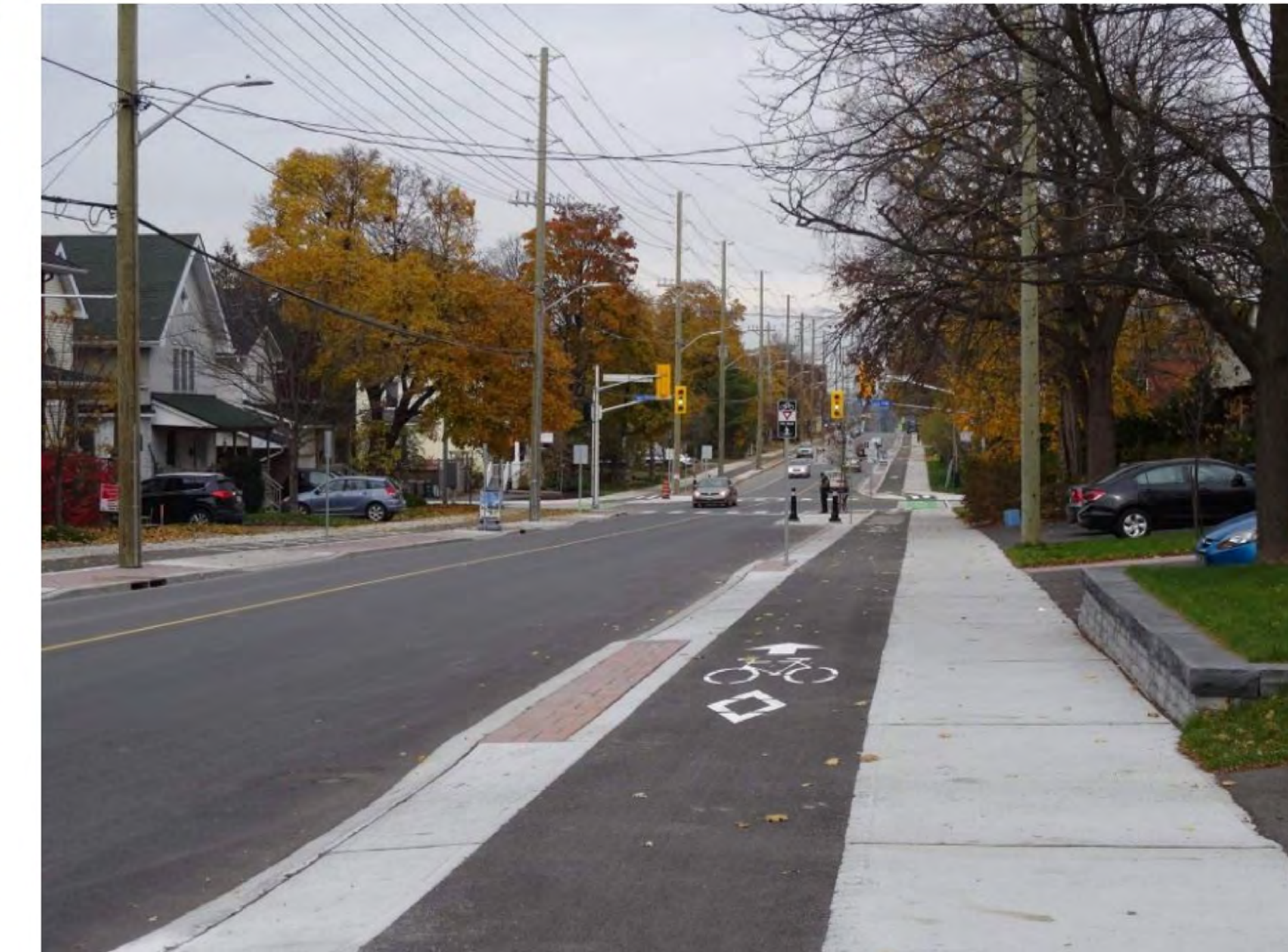
EXAMPLE: CYCLETRACK @ CHURCHILL AVE. (OTTAWA)

CROSSRIDES ARE PROVIDED TO ALLOW CYCLISTS TO RIDE THEIR BICYCLE WITHIN THE CROSSING WITHOUT DISMOUNTING