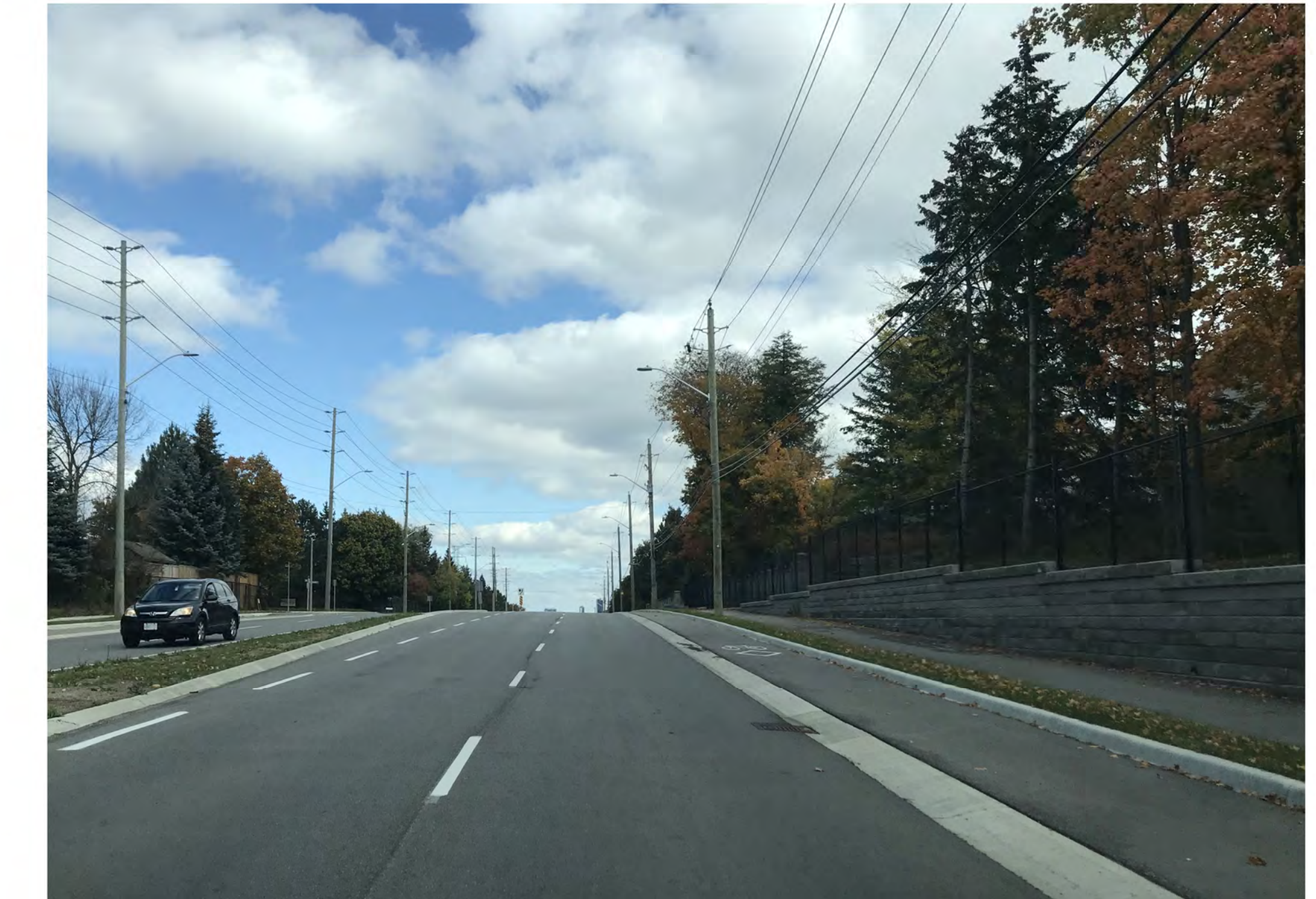
EXAMPLE: RAISED BIKE LANE @ CULLY BLVD (WATERLOO)

PRELIMINARY PREFERRED CYCLING INFRASTRUCTURE FOR THE CORRIDOR WITH SEPARATION