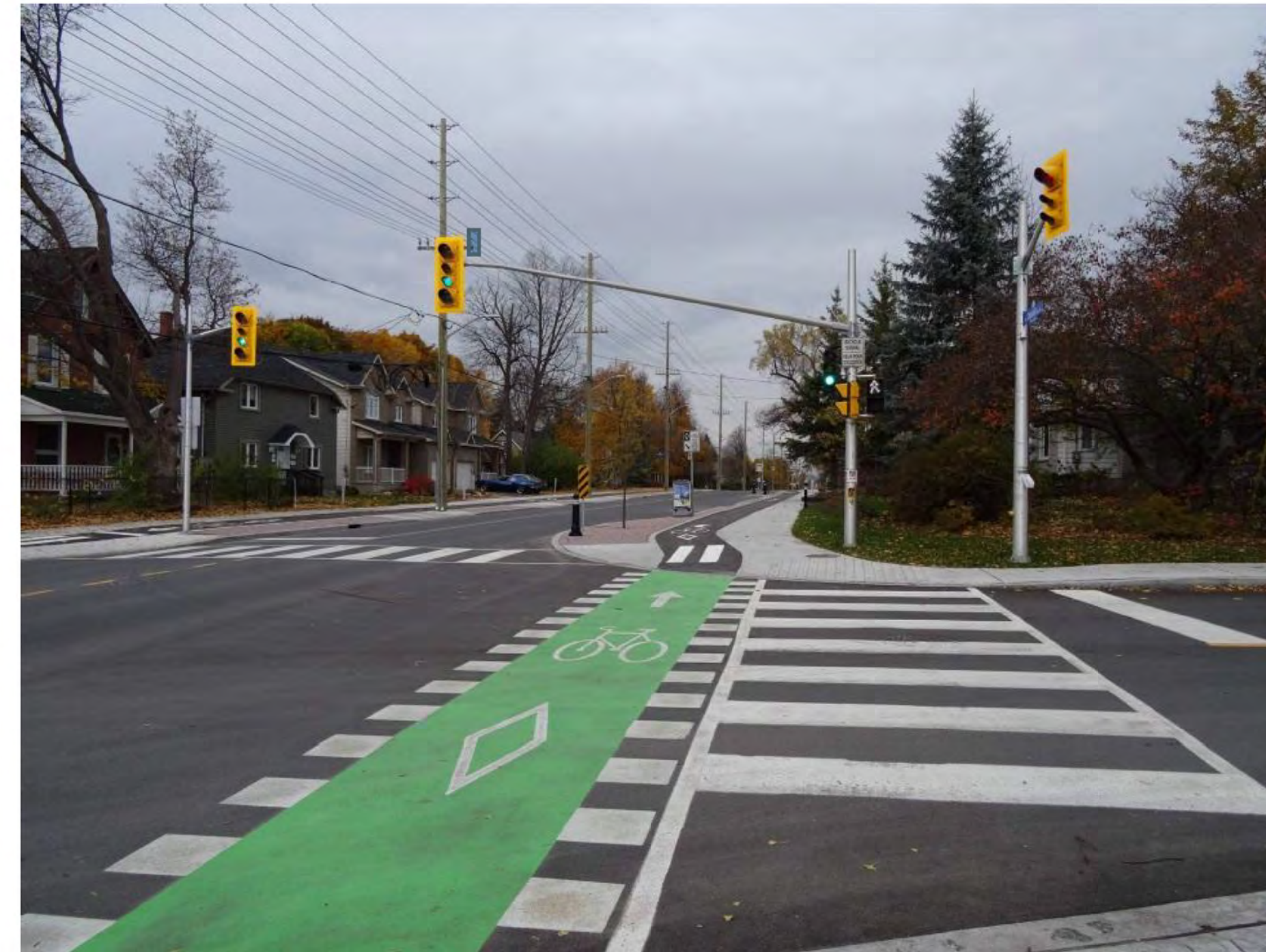
EXAMPLE: CROSS RIDE @ DOVENCOURT AVE. AND CHURCHILL AVE. (OTTAWA)

CROSSRIDES ARE PROVIDED TO ALLOW CYCLISTS TO RIDE THEIR BICYCLE WITHIN THE CROSSING WITHOUT DISMOUNTING