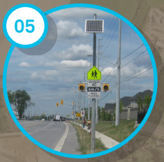
05 Castlemore Public School Signalized intersection with flashing beacons and pick-up / drop-off area to be included in widening /TRCA & MNR approvals