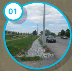
01 Multi-Use Pathway Access requirement to Gore Meadows Community Centre