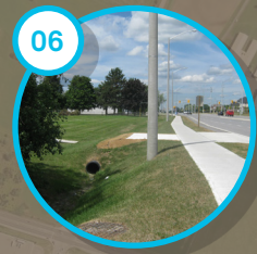
06 Widening Impacts On culverts buried on West side of The Gore Road