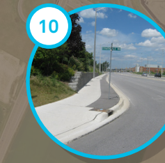
Existing Retaining Wall - Developer's retaining wall to be considered in future widening alignment