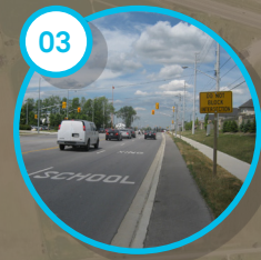
03 Castlemore Public School Grading impact from developments to be considered on widening of The Gore Road