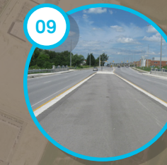
09 North Wylie's Bridge Replacement Anticipated /TRCA & MNR approvals