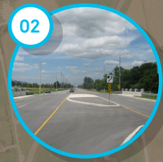
02 Castlemore Bridge Widening of Sidewalks Required