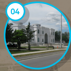
04 Naasksar Sikh Temple Dedicated right turn lane for temple