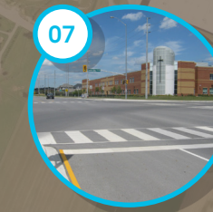
07 Cardinal Ambroziac School Pedestrian Safety and access to school