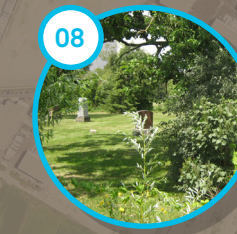
08 St. John's Cemetery Horizontal alignment constraint - Ground Radar Survey Required